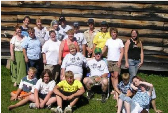
Klock/ Wells Family Klock Reunion 2006