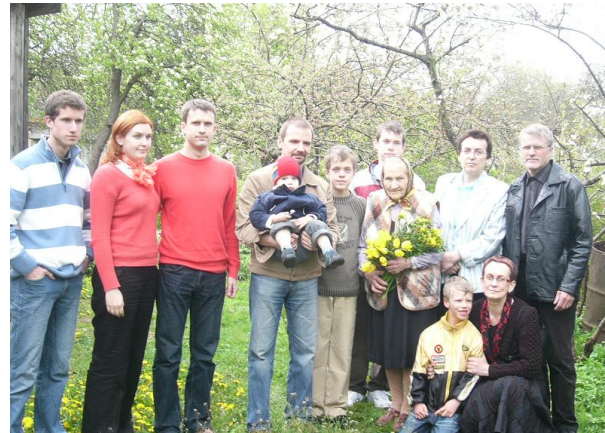
The Kloks of Latvians