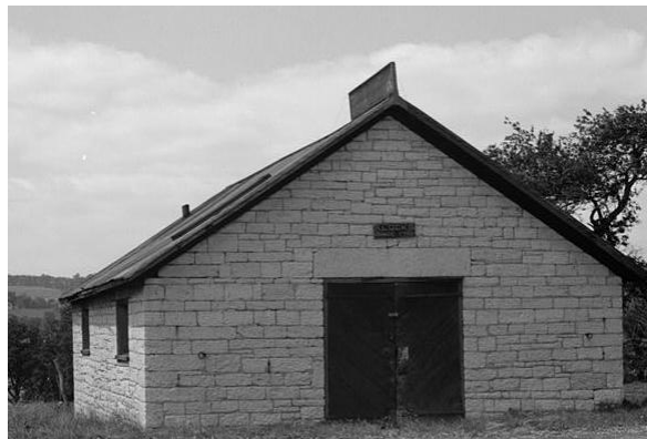
Fort Klock Blacksmith Shop

experience for visitors is costly. The cost of restoration work and maintenance of all the historic structures can be great. Last year Fort Klock completed a masonry restoration project on the main house which cost $39,900. Of that amount $16,700 was covered by a New York Heritage Grant, the remaining $23,200 was paid for by Fort Klock.